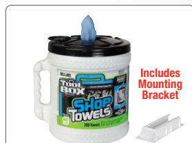
Z400 BIG GRIP® Bucket of Shop Towels