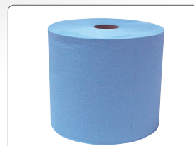
Z400 Jumbo Roll of Shop Towels