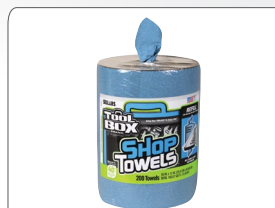
Z400 BIG GRIP® Refill of Shop Towels