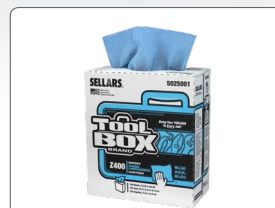
Z400 Interfold Shop Towels