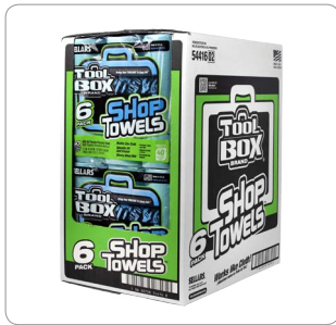
Z400 Roll of Shop Towels 6-Pack Outer Case

**SCOTT is a registered trademark of Kimberly-Clark Worldwide Inc.