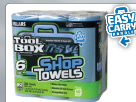
Z400 Roll of Shop Towels 6PK