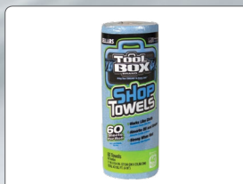
Z400 Roll of Shop Towels

Made With 40% Post-Consumer Recycled Fibers*