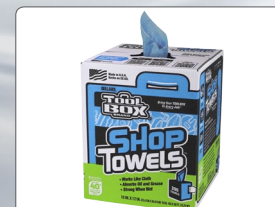
Z400 Box of Center-Pull Shop Towels