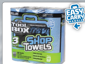
Z400 Roll of Shop Towels 3PK